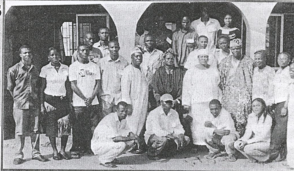
• The baale and chiefs of Saala community pose for a group photograph with the participants after the training programme.

"Our aim is to aggregate efforts at fighting the dreaded disease of HIV/AIDS, hence the need to train those who will go out and spread