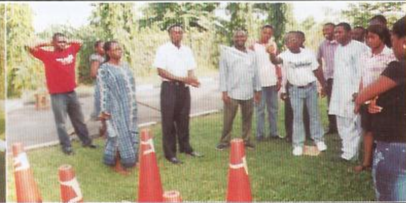
Group Work on Leadership