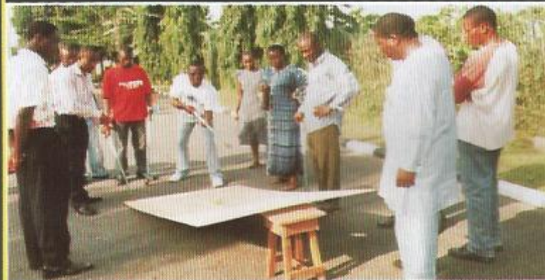
Group Work on Leadership