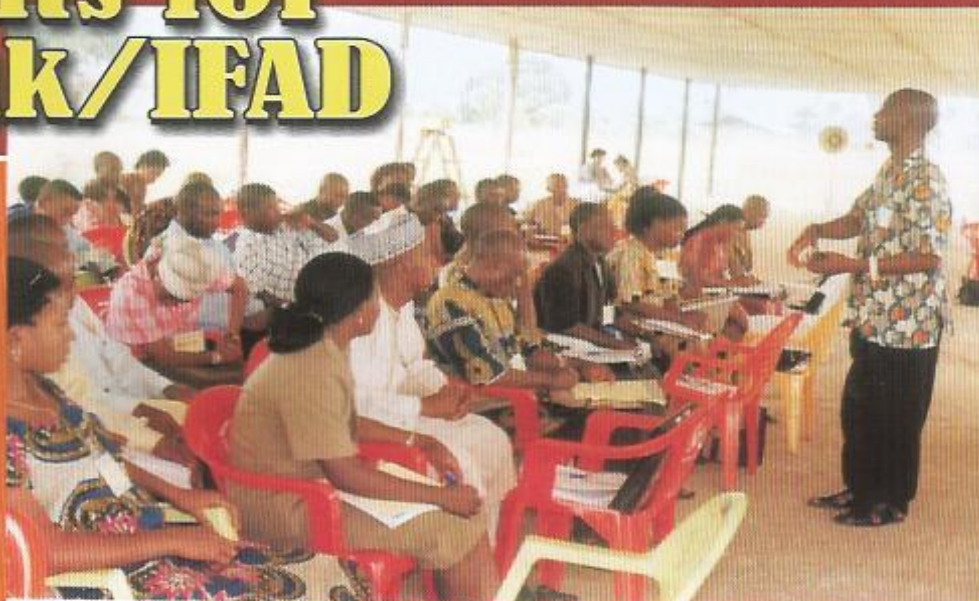
Director of Eclipse consulting Facilitating the programme

The major tool used in the village areas was the PARTICIPATORY RURAL APPRAISAL ( PRA) . This was used to formulate Action Plans for the communities. The field activities will be replicated by other participating states in their respective village areas. In all 54 participants were selected for the training.