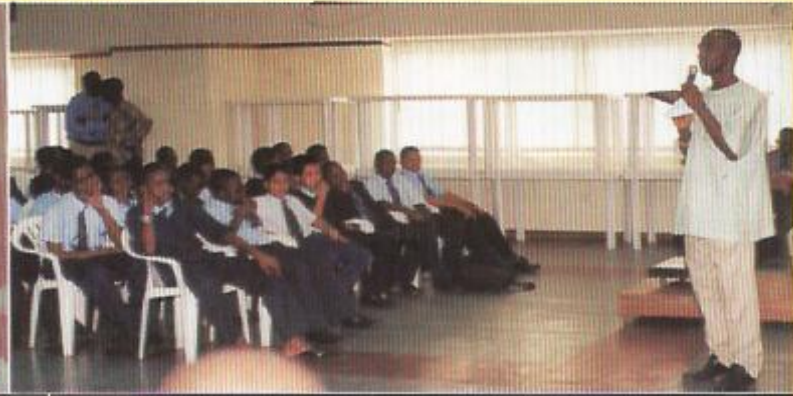
Talk on Drug Abuse with Students paying rapt attention