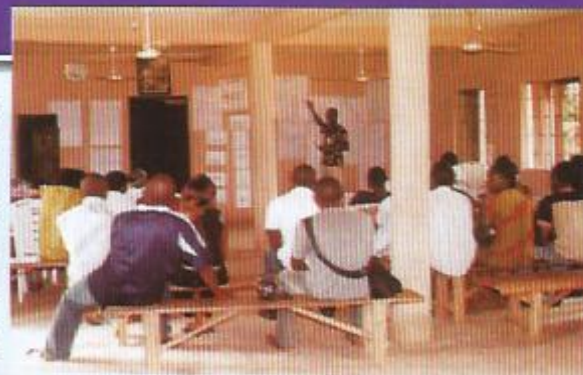
Cross Section of animators during the training

motivation and Attitude building. The training