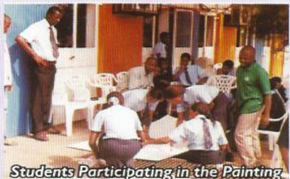
Students Participating in the Painting