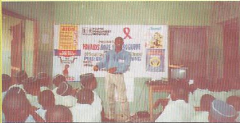
Peer Educators Training