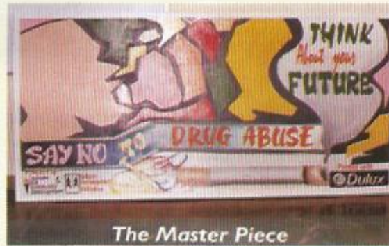
The Master Piece

In all, 29 Students participated in the design.