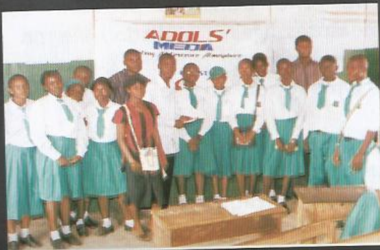
Members of the Network