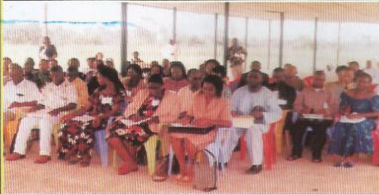
TOT Training for Community Driven Development Teams in Akwa Ibom.