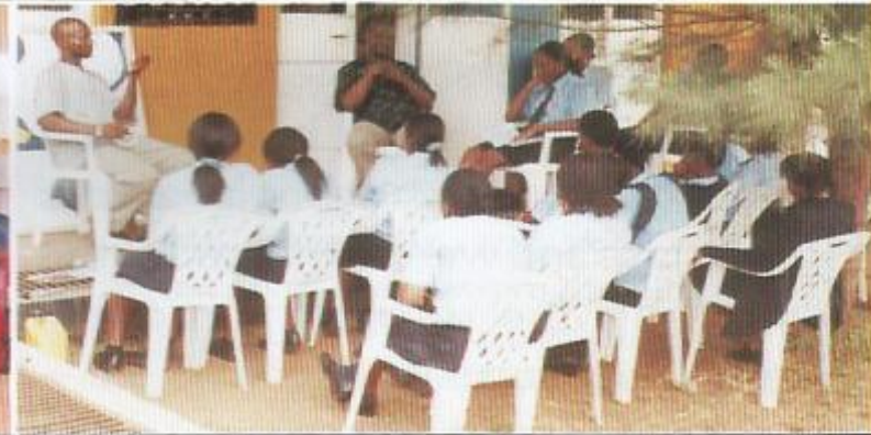
Focus group Discussion on Drug Abuse @ Grange School Ikeja.