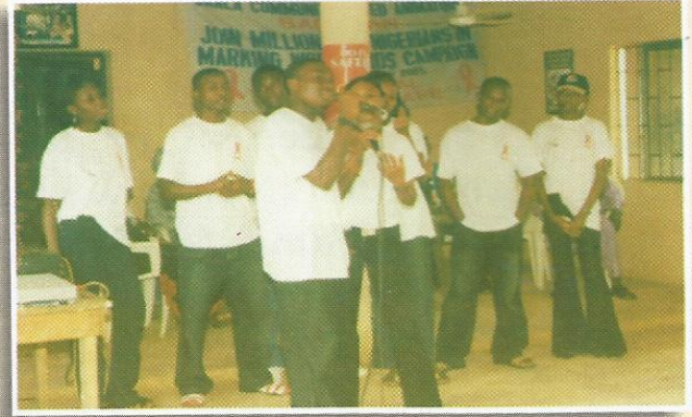
SACOBAN WORLD AIDS DAY