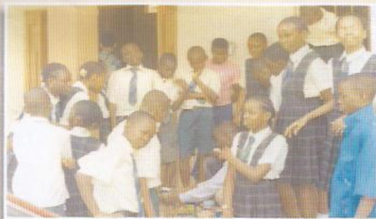
■ CROSS SECTION OF TENADA ■

team building. The network will empower students to deal with social vices. In all 32 students joined the network.