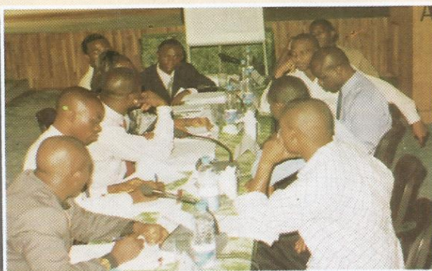
EDI Director during democratic leadership training Workshop held at ALF