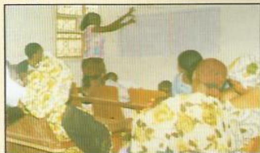
■ SWEET MOTHER PROGRAMME IN SESSION ■

The statistics of maternal mortality mobility in the country has led EDI to focus her capacity building program towards safe motherhood and womens health. Through its program tagged "Sweet mother Programme" EDI is carrying out communication