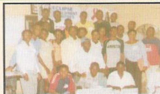
■ TRAINED ANIMATORS ■