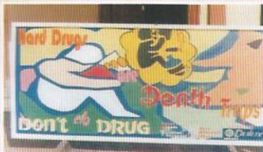
■ FINISHED MURAL ■