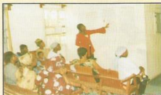
■ ANOTHER SESSION OF ■ SWEET MOTHER PROGRAMME

The program holds at pacific hospitals Iju on every last Wednesday of each month which is a general clinic day. Effort is being made to get to more hospitals and communities with the program.