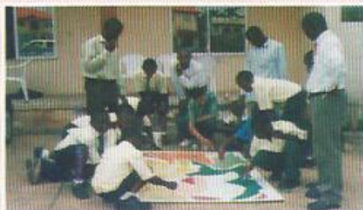
■ A SECTION OF STUDENTS DURING THE PAINTING ■