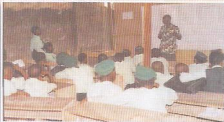
■ STUDENTS DURING THE SEMINAR ■

It was also stressed that the youth should abstain from sex, drugs and unwanted pregnancies as these can truncate their future ambition. The seminar ended by highlighting some career choices and their viability.