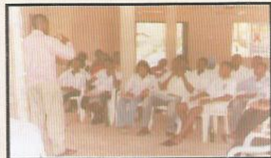
■ DURING THE TRAINING ■

choosen from the community were trained during which they were guided to formulate action plans to be used in spreading the message in the