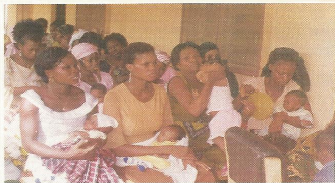
Mothers Listening to Lecture on basic child care

reducing the many unnecessary death in order to meet the millennium development goals.