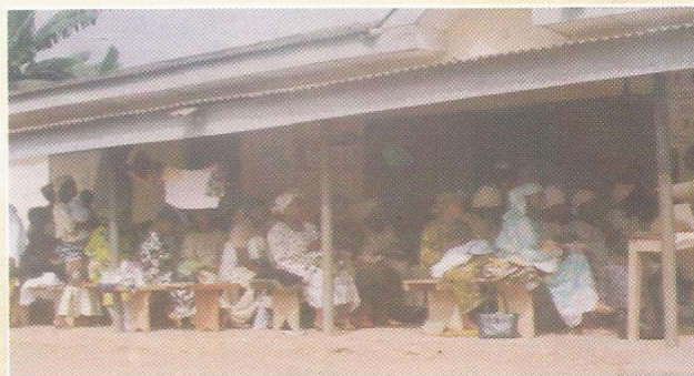
Through the activities of the sweet mother program, large turnout of mothers have been witnessed at community health centres; thus advancing women and Children's health making motherhood safer.

Saving womens lives, saving children lives