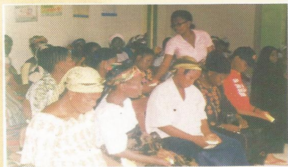
Distributing anti Malarial Drugs.

It all start with the mothers and improving their health and knowledge. Health Education and Empowerment Initiatives (HEDEN) through her effort in the communities is bridging the gap and