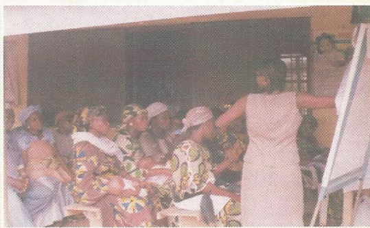
Nursing mothers listening to lectures on basic child care