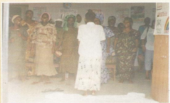
Exercise Session for Pregnant women.