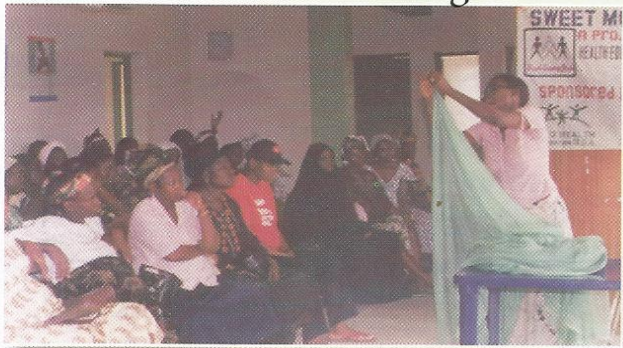
Demostration of Mosquito Net Usage

lectures, video sessions on childcare, pregnancy care and exercise sessions. It also includes counselling sessions for mothers. The program is facilitated in some of the health centers in yoruba language due to the level of literacy in these