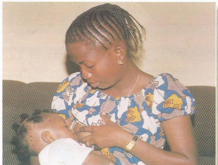
Breastfeeding saves children's lives